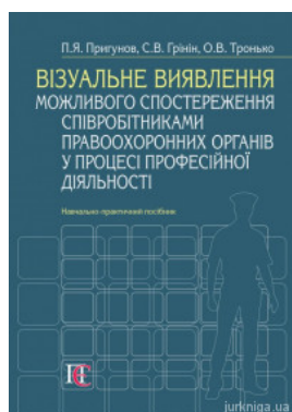
Візуальне виявлення можливого спостереження співробітниками правоохоронних органів у процесі професійної діяльності