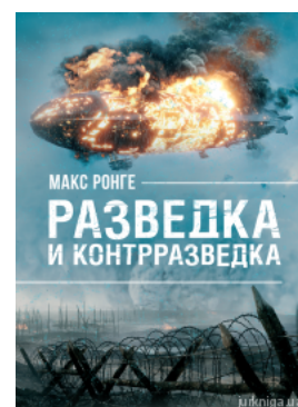
Разведка и контрразведка

Перейти до галузі права Конституційне право