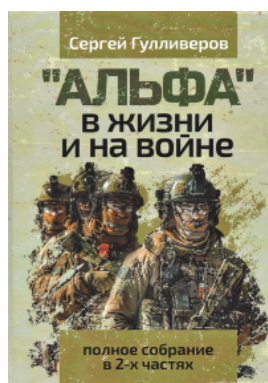
"Альфа" в житті і на війні. Полное собрание в 2-х частях