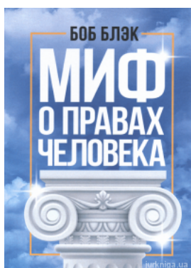
Миф о правах человека