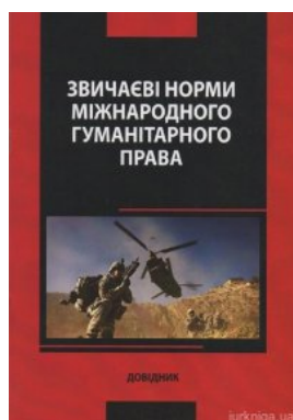
Звичайні норми міжнародного гуманітарного права