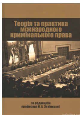
Теорія та практика міжнародного кримінального права