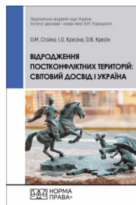
Відродження постконфліктних територій: світовий досвід і Україна